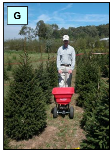
Fig. 1. Images of a tractor-mounted (A and B) Herd spreader or (C and D) Vicon spreader; an on / off switch for the Herd spreader mounted on the (E) fender of a tractor or (F) beneath the tractor seat; and (G) an Earth-Way push spreader being used to apply fire ant bait in a commercial nursery.